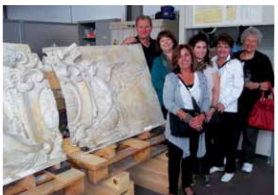
Ohio members in the Marble Restoration Lab, with their restoration "Model for the decoration on the new staircase of the Vatican Museums" by Antonio Maraini