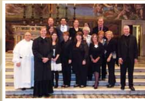
Members pose during their after hours tour of the Sistine Chapel