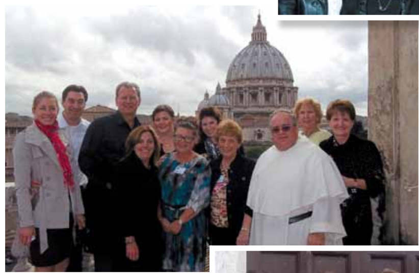
Ohio Members on the balcony above The Tower of the Winds