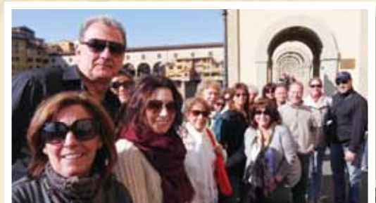
Ohio Chapter in Florence, Italy