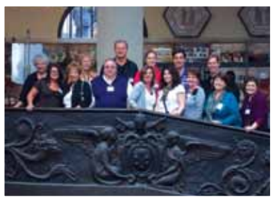
Ohio members on the Vatican Museum staircase