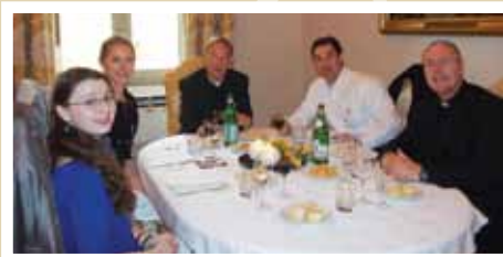
Ohio Chapter members enjoy lunch in the Casina of Pius IV in the Vatican Gardens