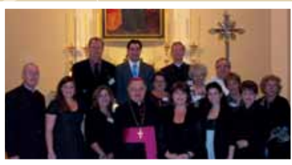
Ohio members with the new Governor of Vatican City, Archbishop Giovanni Bertello