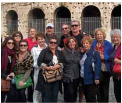
Patrons group in front of the Coliseum