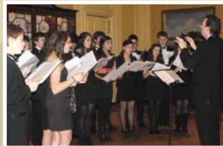
Solon High School Madrigals performance